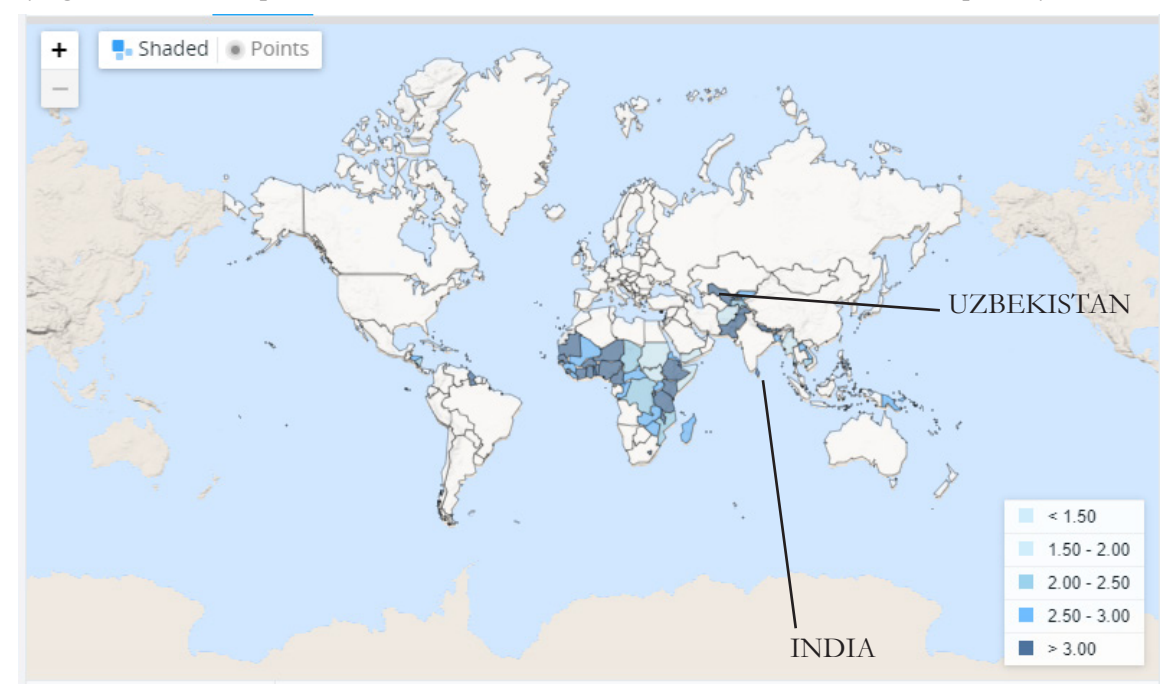
Figure 3 The World Bank CPIA Transparency, Accountability, and Corruption in public sector

Uzbekistan has recently undergone a significant reform of its anti-corruption policies. In 2017, President Mirziyoyev announced the creation of a dedicated anti-corruption agency responsible for investigating and prosecuting corruption cases. This marks a notable shift from the previous system, which primarily relied on the Prosecutor General's office to handle corruption cases. The newly established agency is a promising development in Uzbekistan's fight against corruption, as it comprises trained investigators and prosecutors who are better equipped to tackle complex corruption cases. Moreover, the introduction of mandatory asset declarations for public officials represents a crucial step in enhancing transparency and accountability. However, there are concerns that the Uzbekistani government's current anti-corruption approach may place too much emphasis on punitive measures, potentially overshadowing the essential need to address the underlying causes of corruption, such as weak institutional frameworks and lack of transparency.